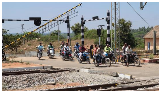
A Rail-road crossing