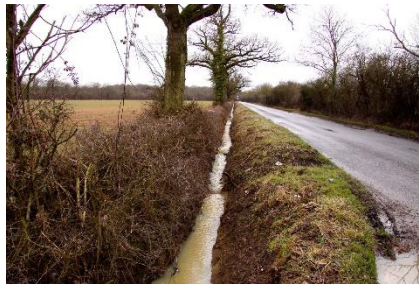
A ditch at the side of a road