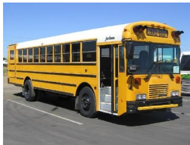
Black Stripes on the side of a school bus